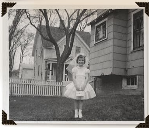
*This plan may show options available and may not reflect the actual home detailed.